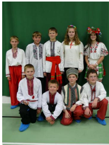
Children of Chernobyl