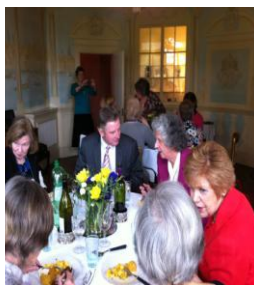
Headmaster enjoying a catch up with the ladies