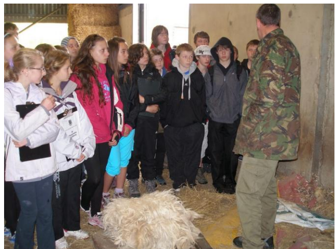
S1 on their Geography Field Trip

They then went to the David Marshall Lodge in Aberfoyle to look at the forestry.