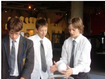
S1 at the Science Centre