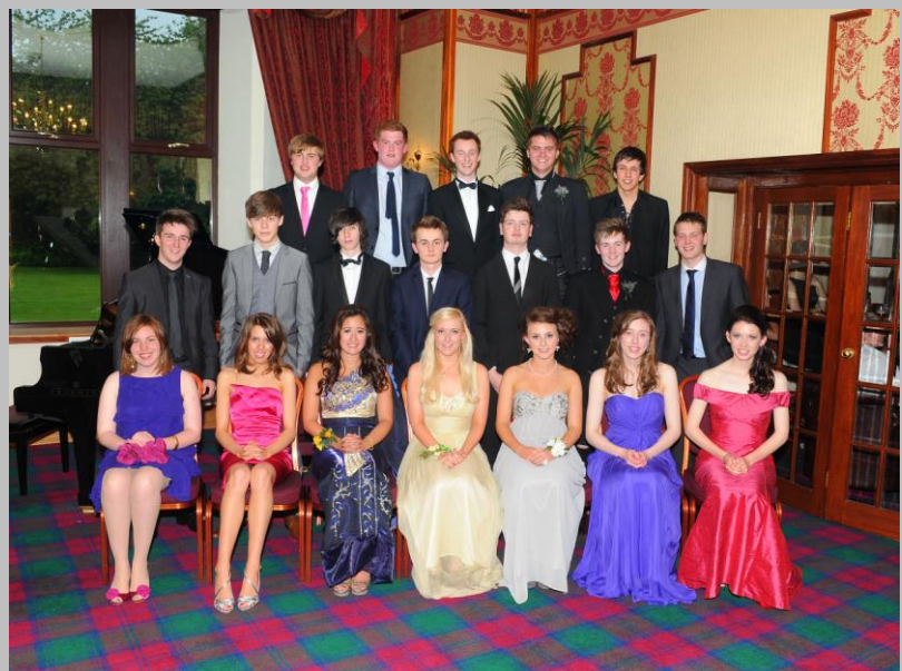
S6 at their farewell Prom