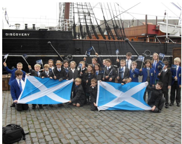
J4 and J5 at Discovery Point

After a tour of the ship and the exhibition, the children had the opportunity to buy souvenirs in the gift shop before heading back to school.