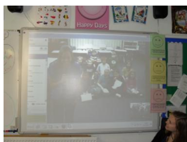
Junior 5 Skyping