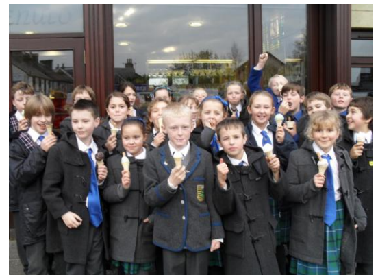
J6 Trip to Corrieri's