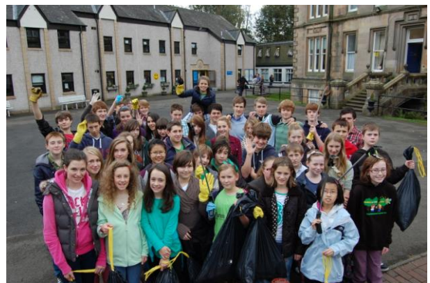
Brown House after their litter pick at the University

For Eco week however, as well as the usual activities, the focus was also on Environmental issues. The additional eco activities pupils participated in included things like litter picking, waste minimisation, energy saving, water, health and well being, transport, biodiversity upkeep of the school grounds and sustaining our World, food and environment.