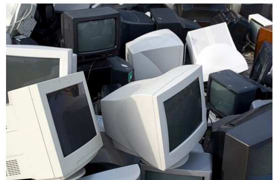
Some of our obsolete computer equipment