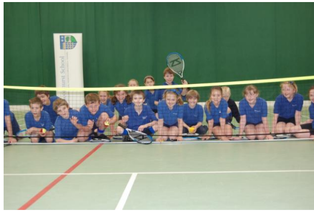
J6 with the new Tennis Equipment