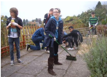
Visit to Drumpark House